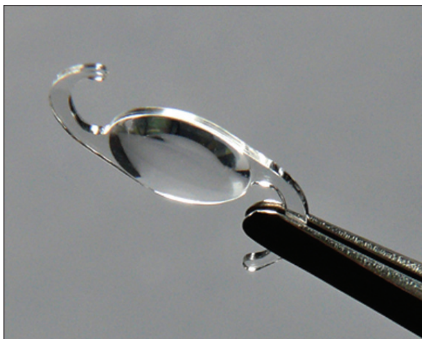
Figure 2. The Softec HD is a one-piece hydrophilic acrylic lens suitable for microincisional insertion.

IOL manufacturing tolerances. The ISO benchmarks, however, are outdated and surprisingly lax (Figure 1). All manufacturers claim to exceed these tolerances, but they are reticent to go on the record with actual data. The difference with the Softec HD aspheric lens (Lenstec, Inc., St. Petersburg, Florida) (Figure 2) is that its manufacturer actually publishes manufacturing tolerances (Figure 1), thus creating the most accurate aspheric IOL advertised on today's market.