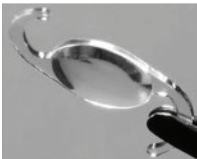
Figure 2: The Lenstec Softec HD Intraocular Lens

An intraocular lens, or IOL, is a plastic replacement lens for your cataract. It works the same as your natural lens. Once your eye surgeon replaces the cataract with the IOL, vision is usually restored within days.