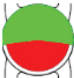
Figure 4: ClearView 3 optic portion