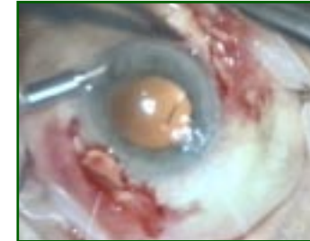
Figure 11 Make the appropriate astigmatic enlargement to the incision. Fold the lens length ways, making sure that you avoid suture entanglement.