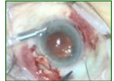
Figure 10 Feed the second suture through the incision, under the iris and into the sclera through the ciliary sulcus. The needle should emerge again in the flap base in line with the three marker points. Pull the suture through until the needle comes through the sclera.