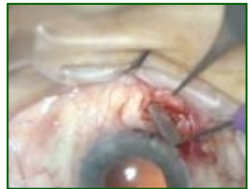
Figure 3 Form another flap from the opposite marker point. For ease with infero-nasal flaps lift a fornix based scleral flap. (Folding the flap away from the limbus will aid vision.)