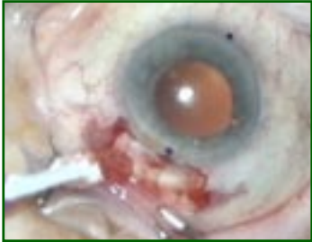
Figure 1 Cut back the conjunctiva away from the limbus using one of the outer points as a center guide

Mark two further points at the limbus so that all three align at approx. 90° to the steepest axis where you will eventually make your astigmatism control incision.