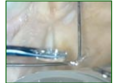
Figure 12 Insert the lens, again insuring that the haptics are in the same direction as the sutures that have already been fed through the sclera.