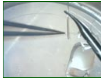
Figure 8 Feed the first suture through the incision, under the iris and into the sclera through the ciliary sulcus. The needle should emerge again in the flap base in line with the three marker points. Pull the suture through until the needle comes through the sclera.