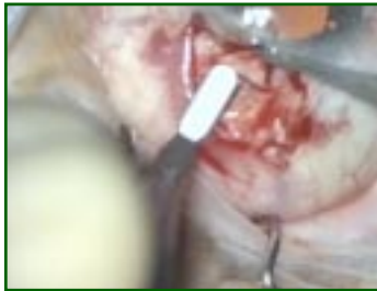
Figure 2 Form a 4mmX4mm trabeculectomy style flap in the sclera using the marker point as a center guide. (For coverage of the scleral fixation suture.)