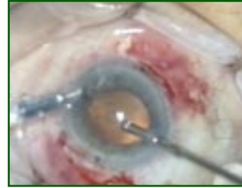
Figure 6 Place the lens on a watery surface, keeping it moist at all times. Feeding a double threaded suture through the middle hole in one of the haptics, leave the small loop of the suture behind.